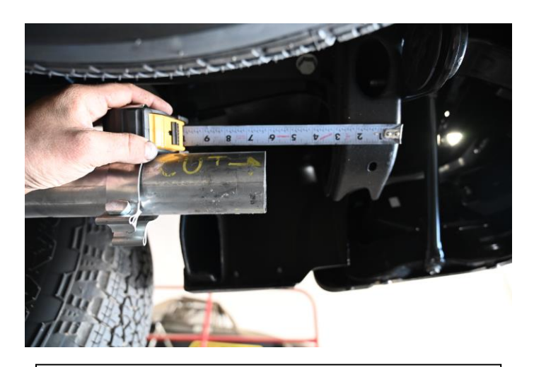
3) THIRD, CUT PASSENGER SIDE OUTLET PIPE 6" FROM THE REAR LEAF SPRING MOUNTING BUCKET