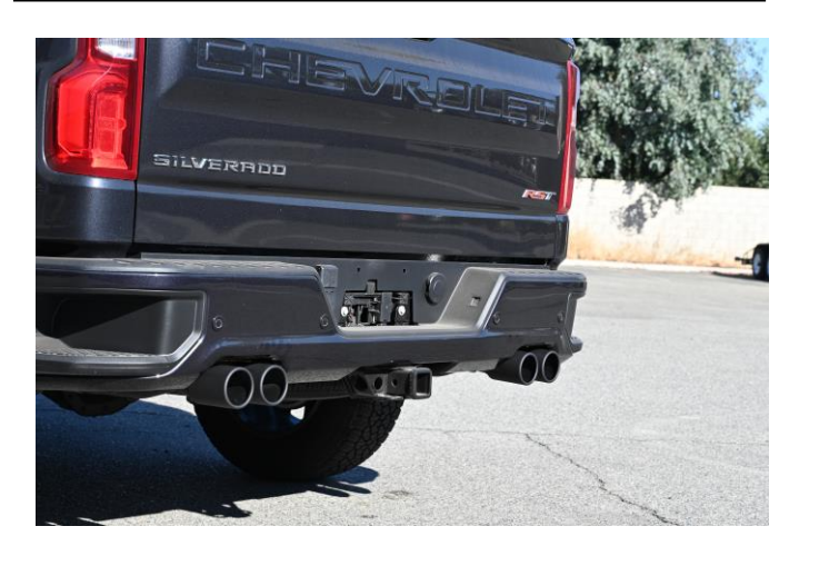
4) FINALLY, ADJUST TIPS TO DESIRED LOOK AND DEPTH THEN TIGHTEN. NOTE: THESE TIPS HAVE AN EXCEPTIONAL AMOUNT OF DEPTH ADJUSTMENT

GIBSON EXHAUST systems are designed on a factory stock vehicle. Any aftermarket products installed could increase the sound levels of this Exhaust. Make sure there is a 1" clearance from ALL rubber brake lines, shock boots, fuel lines, tires, etc. to prevent heat related damage or fire.