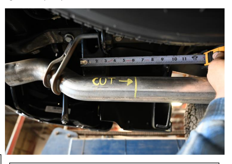
2) SECOND, CUT DRIVER SIDE OUTLET PIPE 6" FROM THE REAR LEAF SPRING BUCKET.